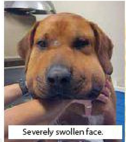
Severely swollen face.

Larchmont Animal Clinic 315 Larchmont Boulevard Los Angeles, CA 90004 (323) 463-4889